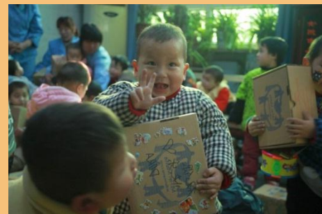
Chinese New Year 2012 Happy Children in China